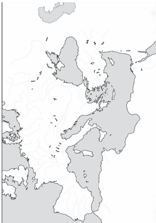
The Rise of the Church &amp; the Fall of Rome 43