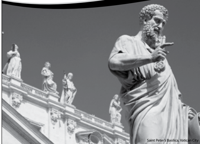
Saint Peter's Basilica, Vatican City