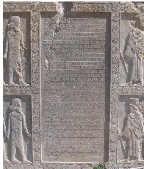
Fig. 1. Palace Darius W. Entrance Inscription. License CC0 1.0 Universal. Used in accordance with federal copyright (fair use doctrine) law.

Fig. 1 is a photo of the inscription that Anstey alleged was the work of a “dilettante tourist”. Note the exquisite quality of the stone carving and the centrality of the inscription in its mid-relief stone “picture frame” that appears to depict the historical figures named in the inscription.