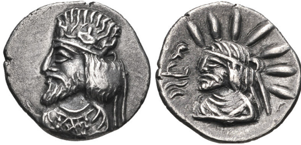
Fig. 3. Artaxerxes III Coin.

insistence of the Parian Chronicle that these two kings did indeed exist completely invalidates Anstey's thesis. Fig. 3 shows a coin issued by Artaxerxes III.