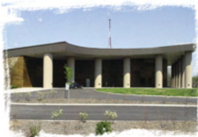
The Creation Museum in America will feature many exciting displays, including large scale dinosaurs

Dinosaurs can be a wonderful tool to reach young children. We sell many materials that can help!